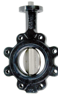
Lug Butterfly Valve