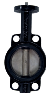
Wafer Butterfly Valve