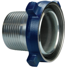
6" and 8"