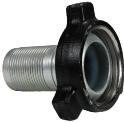
3" and 4"