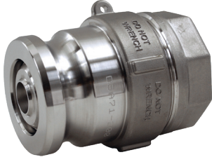
Adapter x 1-1/2" and 2" Female NPT