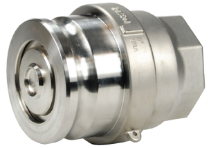
Adapter x 3" Female NPT